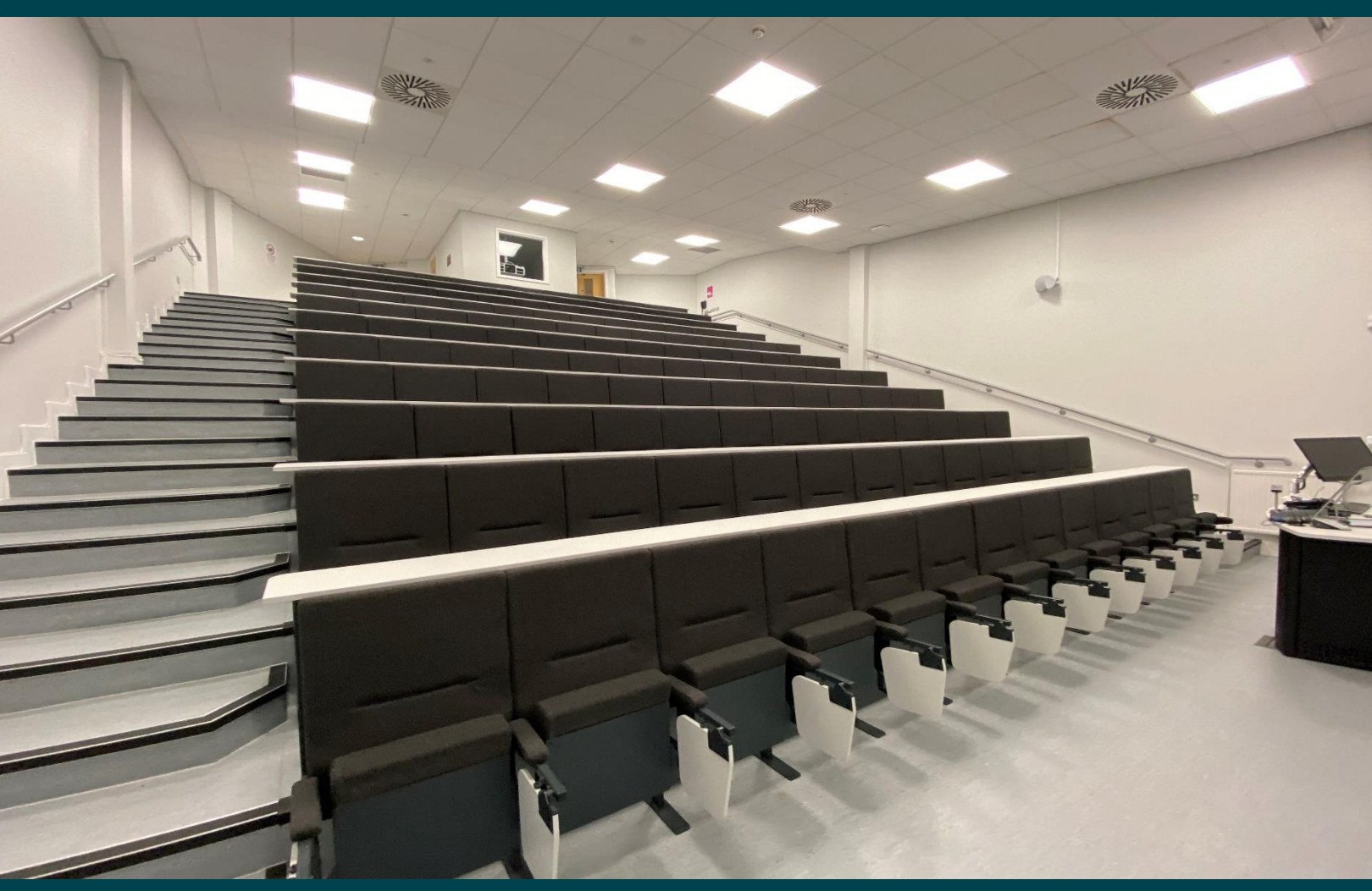
Lecture Theatre 2D1