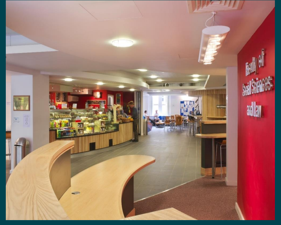
The entrance and foyer